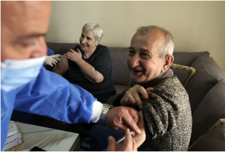
An Albanian couple get vaccinated against COVID-19 in their village of Sukth in Albanian in November 2021.