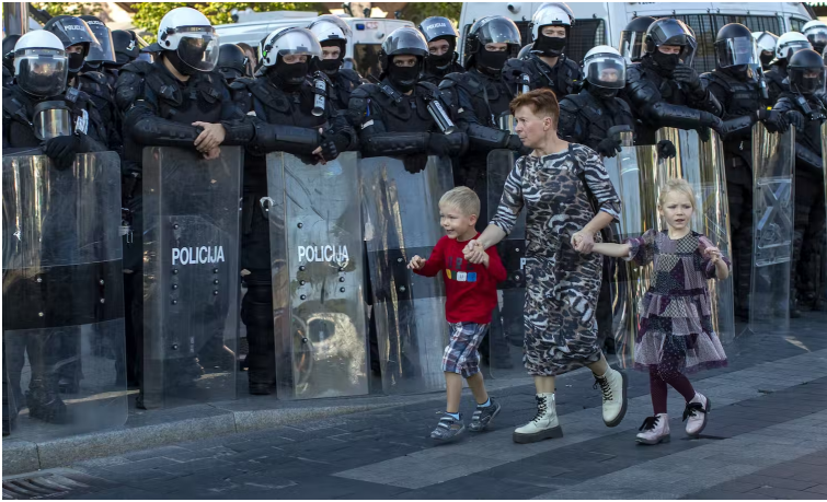
A woman with her children walks past riot police after an anti-vaccination protest in Vilnius, Lithuania, in September 2021.