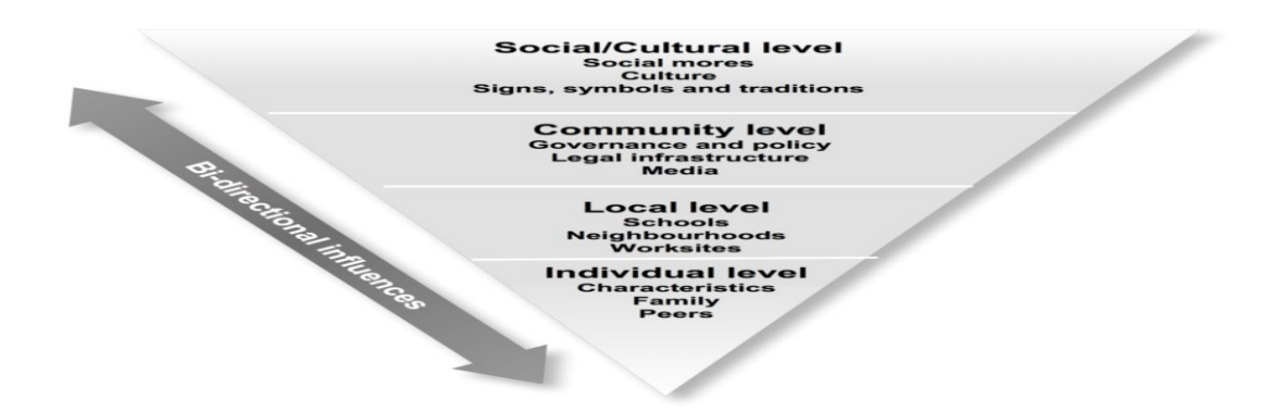
Figure 2 Diagram of BEM

plastic pollution mechanisms and combination of intervention methods that can lead to improved behaviours and sustainable practices.