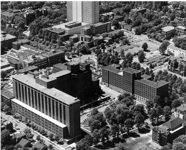
Figure 5: Aerial photograph of the Victoria General Hospital, with new Centennial wing. The Grace Maternity Hospital can be seen Summer Street, adjacent to the Sir Charles Tupper Building. The roof of the Jubilee Building is visible directly west of the Victoria Building. The Halifax School for the Blind is noted on the opposite side of Tower Road; this is now a parking lot. ca. 1970.

In the 1970s, a series of labour disputes troubled the institution. A mass resignation of over 700 nurses in September 1973 brought the hospital to a standstill for five days, until a settlement with the provincial government resulted in steps to improve working