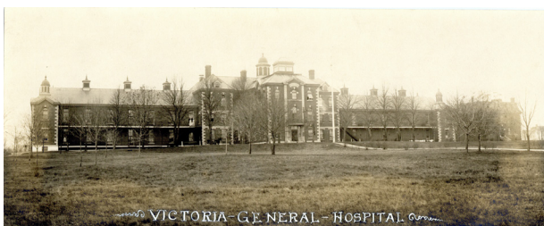
Figure 3: A Victoria General Hospital ward as seen from Tower Road. The centre Jubilee Building remained in use until its demolition in 1980. 1922.