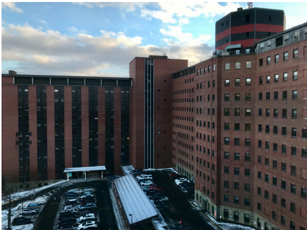
Figure 6: The Centennial and Victoria Buildings as they appear now. The differently-coloured brick on the Victoria Building reflect later additions from the original 1948 structure. 2019.

In its final year as an independent hospital, the Victoria General employed 3 000 people, took in 21 838 admissions, and performed 23 201 surgeries. 12 Up to this time, the hospital had transplanted 136 kidneys,