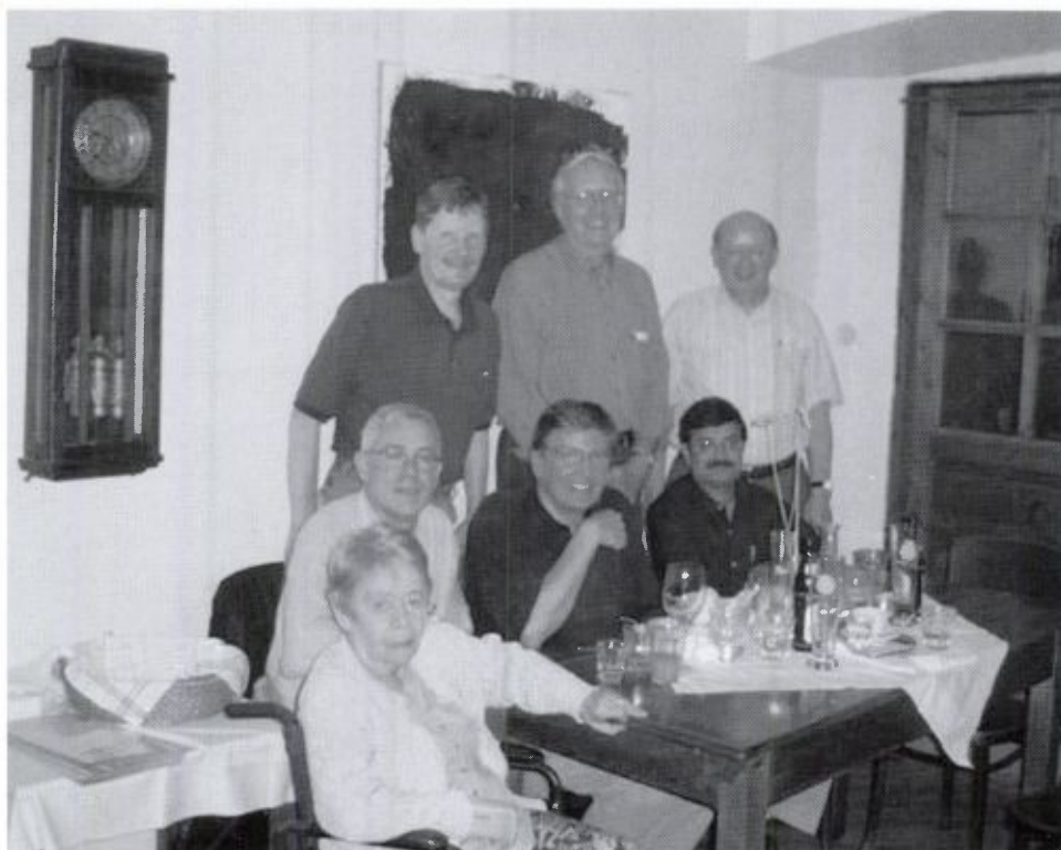
Symbiosis Editorial Board meeting at ISS Congress in Vienna, Austria in 2006.