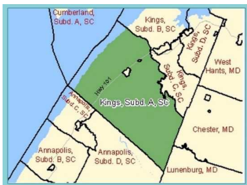
Figure 2 Municipality of the County of Kings Subdivisions A, B, C and D (Statistics Canada, 2012)

Kings County is divided into four census subdivisions: A; B; C; and D (Statistics Canada, 2012) (Figure 2). Subdivision A covers the larger half of the Kings County area, while B, C and D make up the other, smaller half (Statistics Canada, 2012). In 2011, the population of subdivision A was 22,103, down 0.3% from 2006. Subdivision B had a population of 11,990, down 0.4%. Subdivisions C and D had the smallest populations of 8,275 and 5,201, down 1.9% and 5.4% respectively between 2006 and 2011.