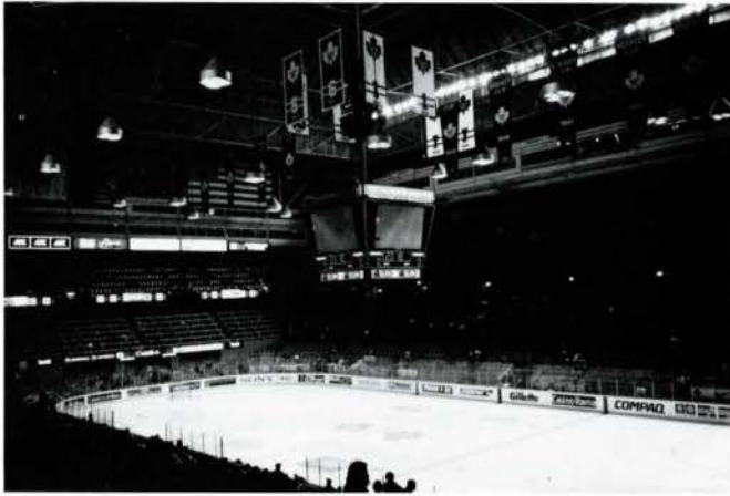
Figure 2. Maple Leaf Gardens, Toronto, Ontario, built in 1931 at a cost of $1.6 million, currently seats more than 15,000. Ross & Macdonald, architects.

Motors] Place, little was said about their old home, the Pacific Coliseum (Figure 3), as it quietly passed into oblivion.