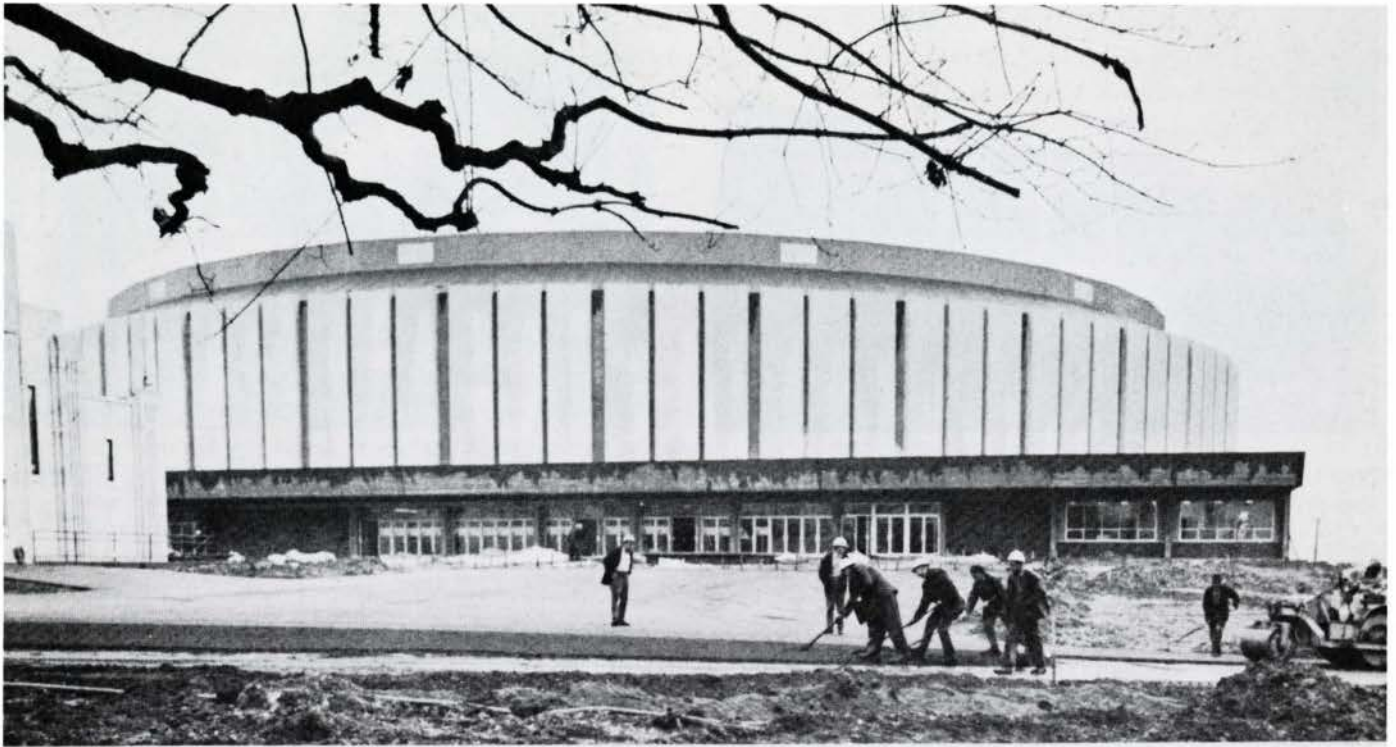
Figure 3. The Pacific Coliseum, Vancouver, British Columbia, built in 1966-67 at a cost of $6 million, was designed to be Vancouver's all purpose exhibition and sports building. It was deemed obsolete before its 30th birthday. W.K. Noppe, architect. ("Pacific Coliseum Souvenir Edition," Pacific National Exhibition, [1968])

What is immediately clear from Drummond's thoughts is that there is much more to the Forum than its merits as a piece of architecture. Here, the importance of brick and mortar is supplanted by collective memories. It is the people that give these buildings life, and it is their shared cultural activities that give these buildings meaning. This is precisely what Drummond means when he states that "for the vast majority of the population the urban places that evoke the most poignant memories are not necessarily those of architectural significance." Sports columnist Jack Todd summed it up best when he stated that it was "the people who made the building, not the building that made the people. The Montreal Forum has never won a Stanley Cup." 5