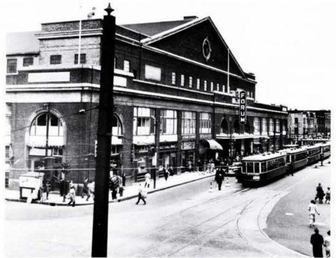
Figure 4. The Montreal Forum (built in 1924, John S. Archibald, architect) in 1947, before the expansion of 1949 and the modernist reconstruction of 1968 (Kenneth Sedleigh, engineer; Stone & Webster, architects).

Of equal importance to the relationship between the arena and the people is the arena's relationship with the city. As a civic monument, the arena becomes an outward representation of the city, a badge the city may wear with pride. In "The Stadium in the City: A Modern Story," Niels Nielsen wrote that "the city influences the stadium, just as the stadium influences the city; the stadium landscape is both staged by the city and a staging of the city." 6 This duality demonstrates the important role an arena can play in the overall landscape of a city. The conventional wisdom is that "world-class" cities, an oft-used phrase these days, have "world-class" arenas and stadiums, sometimes more than one. The importance of hockey arenas to Canadian cities is highlighted by the recent phenomenon of team owners holding cities for ransom with