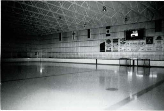
Figure 1. Tibury Ice, Delta, British Columbia, built in 1995 at a cost of $2.5 million, seats 100-150 people in the arena and the bar/viewing area. CTA Design, architects. (I. Shubert, 1998)