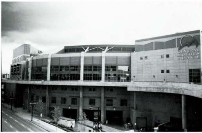
Figure 5. GM Place, Vancouver, completed in 1995 at a cost of $160 million, seats 19,056 for hockey. Brisbin Brook Beynon, architects. (I. Shubert, 1998)