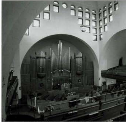
FIG. 5. FIRST PRESBYTERIAN CHURCH, CHATHAM – INTERIOR.