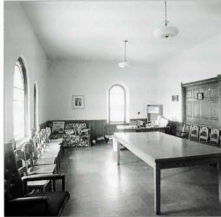
FIG. 11. PARIS PRESBYTERIAN CHURCH – SUNDAY SCHOOL CLASSROOM.