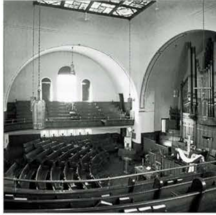
FIG. 9. PARIS PRESBYTERIAN CHURCH – INTERIOR. | MALCOLM THURLBY

The building that Rutley designed for Paris was erected in 1894 at 164 Grand River Street North. It is a large redbrick structure with tall towers, turrets, pitched roof and dormer windows. Redbrick is a "find spot" or feature that is often used in Ontario architecture and the Paris church is no exception. The brick, which Rutley had already used in Chatham, is highly ornamented in Paris. Terracotta plays an important role in the ornamentation of the Paris church. In Chatham, where terracotta is also employed, the ornamentations are very small and mainly consist of carved or moulded tiles. In Paris, Rutley uses much larger terracotta pieces. Since