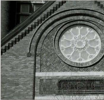
FIG. 4. FIRST PRESBYTERIAN CHURCH, CHATHAM – EXTERIOR DETAIL.