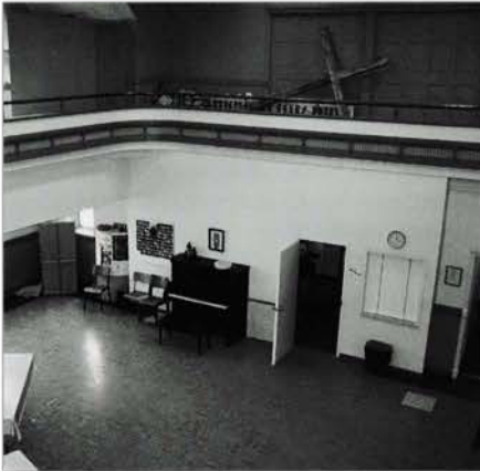
FIG. 10. PARIS PRESBYTERIAN CHURCH – SUNDAY SCHOOL AREA. | MALCOLM THURLBY