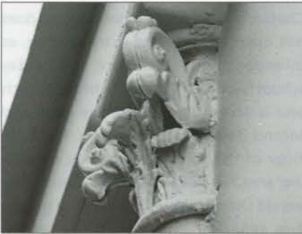
FIG. 7. FIRST PRESBYTERIAN CHURCH, CHATHAM - INTERIOR DETAIL. | MALCOLM THURLBY

The main floor of Rutley's church seats 650 people and the galleries allow for another 350. The Sunday school was connected to the church by folding doors and it could accommodate an additional 500 people, thus the total number of worshippers the church could hold at one time was 1500, an impressive number for such a small city. Rutley, recognizing the ever-expanding Presbyterian population, designed the amphitheatrical seating plan so that doors located along the back of the sanctuary (no longer existing) could be opened and the seats in the Sunday school (now the gymnasium) could be used for the congregation without disturbing the arrangement in the sanctuary itself. That again points to Rutley being a designer who not only looked towards progressive styles for his buildings, but