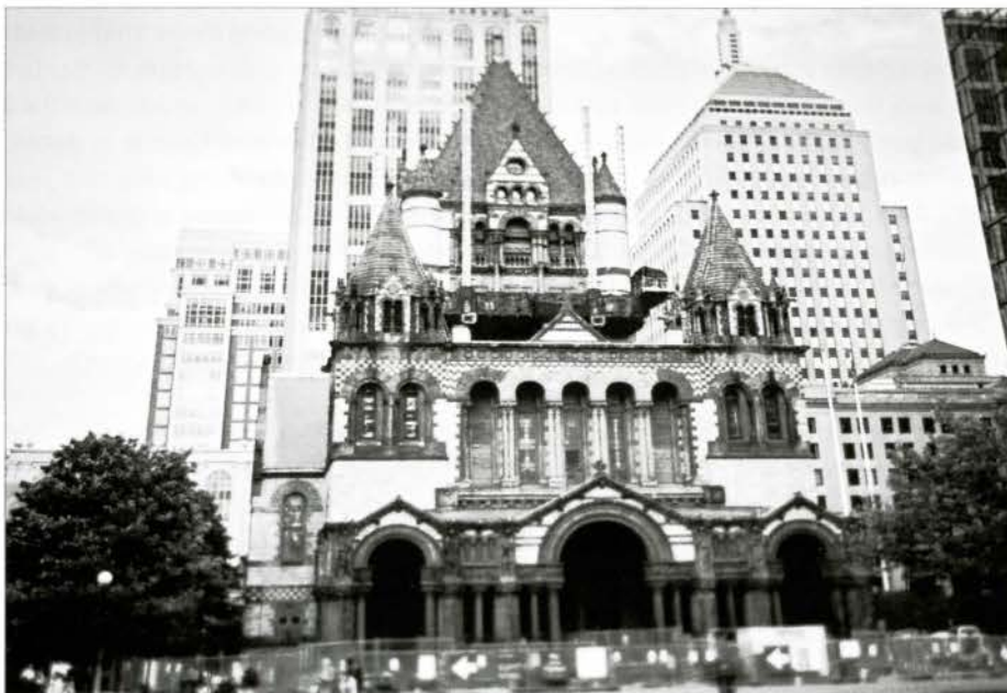
FIG. 1. TRINITY CHURCH, BOSTON, MASS., 1872-77, H.H. RICHARDSON (ARCHITECT) – EXTERIOR.