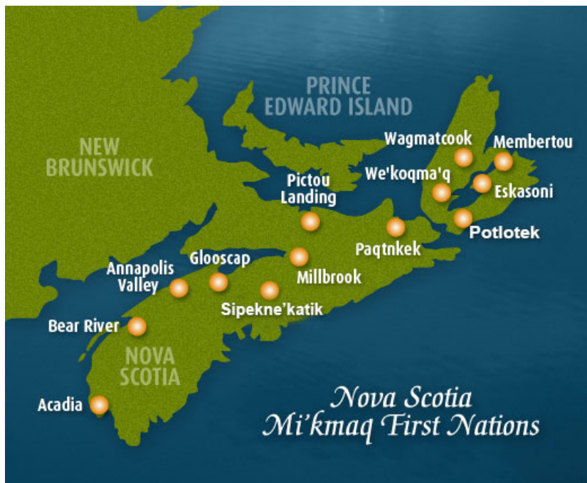
Figure 2: Mi'kmaw Communities in Nova Scotia (Office of Aboriginal Affairs, 2013)

Over five hundred years of colonization has tremendously disrupted Mi'kmaw society. However, since the arrival of the first settlers the Mi'kmaq have developed