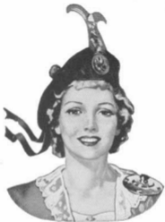
THE MACDONALD LASSIE