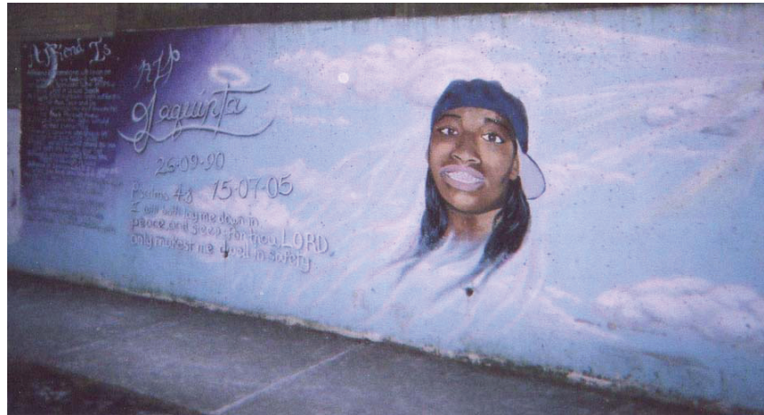
Figure 3. Mural to commemorate the death of a local young man who was killed in the neighbourhood.

Painted a mural in his commemoration (see Figure 3 below), pointing to the importance of a strong sense of community during tragic incidents. Some participants believe that putting conflicts aside in order to support their community would not be possible without the presence of a strong sense of community.