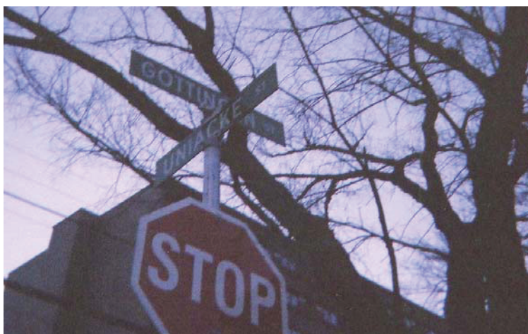
Figure 2. The street signs of Gottingen and Uniacke Streets in the North End of Halifax.