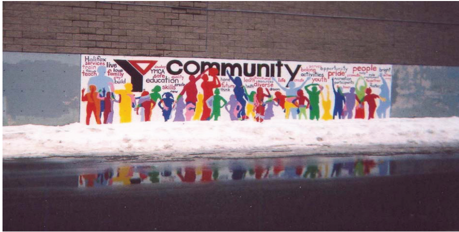
Figure 4. A mural of for the Community YMCA found in the North End. This mural also represents the sense of community talked about by the participants.

It appears that the conflict between adolescent girls in this neighbourhood may have a role to play in their inconsistent views of community services. As discussed earlier, some participants avoided certain neighbourhood spaces to avoid girls with whom they had a conflict. Therefore, it is possible that some participants avoided some community organizations if their “enemies” accessed them. Thus, they could not benefit from the stress-relieving impacts of the services from these community organizations.