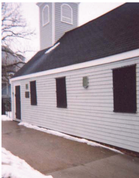
Figure 5. One of the many churches found within this neighbourhood.

Hanging out in a local field where there is a playground, basketball courts, a community garden, and a big open space (see Figure 6 below) was also a stress-relieving activity for most participants. These girls found themselves utilizing this space a lot and often with their friends and family, many times for stress relief. Also, a few participants discussed the importance of a local recording studio where many adolescents, some from different neighbourhoods, came together to sing and record songs. One participant in particular spoke to the importance of this studio as a stress-reliever because it enabled her to sing, which helped her release her stress. She also said that it was a way to make new friends, whom she may rely on for support. “It’s like when I sing, it’s like all my stress just comes out and I feel so much better when I’m singing with my friends. ... I find when I sing, I don’t feel stress” (Participant 5). Lastly, walking in the neighbourhood, either alone or with someone, was also mentioned as an important stress-reliever for some participants. “I just usually take long walks by myself or with a friend or a cousin or a