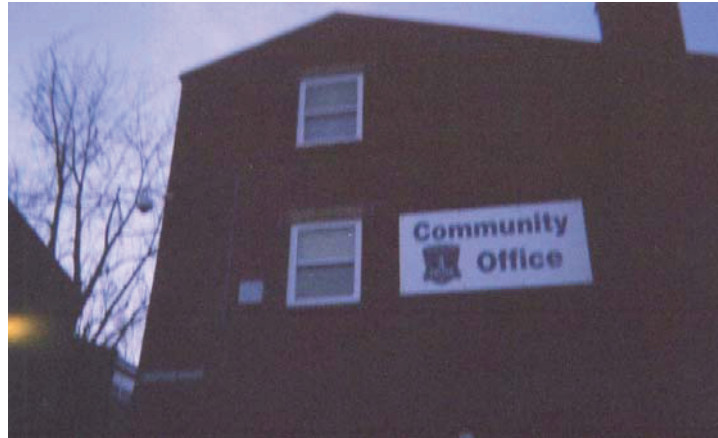
Figure 1. The police’s community office situated within the North End.

Some participants felt that the police target them specifically, stating that when they are just “hanging out” in the neighbourhood, the police often follow them and sometimes wrongfully accuse participants of behaving unacceptably. This was stressful for these participants and therefore, they would avoid certain areas if police officers were present. They also felt that they could not enjoy their time with their friends because they were distracted the need to deal with the police’s presence. Some participants explained that the police also tend to say certain things to them or about them that can be offensive or as one participant called them “smart remarks”.