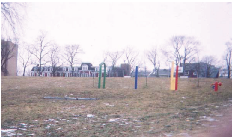
Figure 6. An open field found in the North End.

family member. We just talk, like we'll just like sometimes we'll go deep and just talk about our problems" (Participant 5).