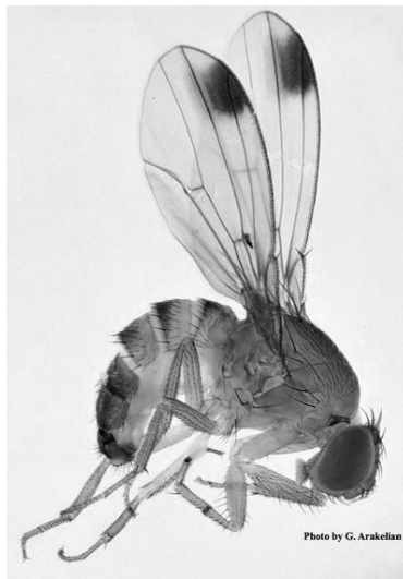
Fig 1 A magnified photograph of a male Drosophila suzukii . Image distinctly shows two dark markings on the tarsal segments of the forelegs and the black spots on the wings.

Drosophila suzukii are small drosophilids (2 to 3 mm) with distinguishing dark spots on the leading top edge of wings of male