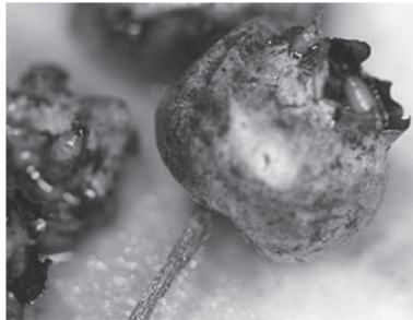
SWD pupation on the surface of blueberries.

After application, continue monitoring for SWD. Re-implement controls as necessary.