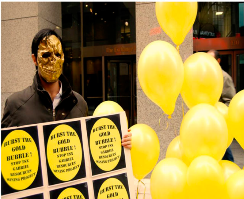
Figure 1. Silent protest at Toronto Stock Exchange, 31 October 2013.

Epoch Times Romania covered the exhibit and published an interview with the curator which was broadly circulated by mainstream Romanian media outlets such as Yahoo, EcoMagazin, and NaşulTv. The Canadian Media Connections (Canadian Hungarian