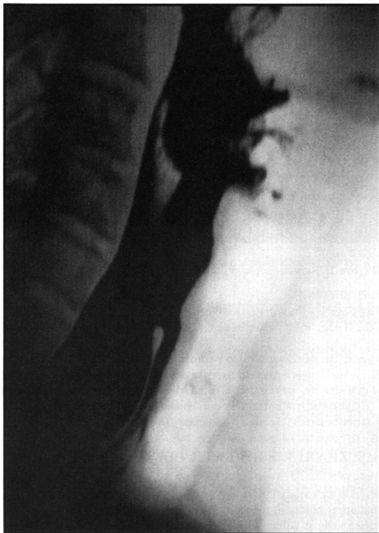
Figure 1. Barium esophagram