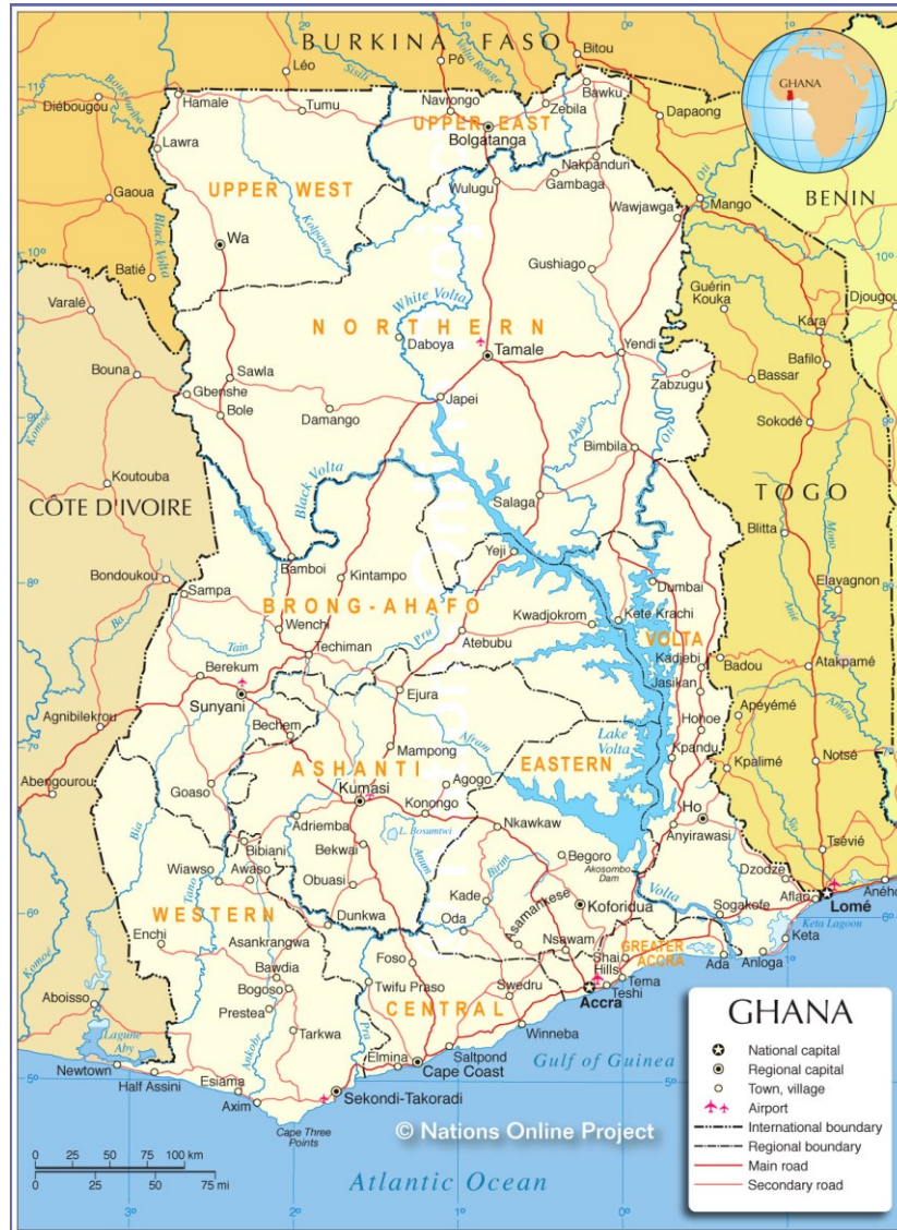
Figure 1 Map of Ghana

Ghana's political stability after independence was marred by a significant number of successful and unsuccessful coup d'états, the first of which overthrew Kwame Nkrumah in 1966 (Government of Ghana, n.d). This saw the end of the first republic. Ghana is currently under the 4 th Republic after a successful coup by Jerry John Rawlings saw the end of the third republic of Ghana in 1981. However, he