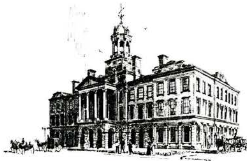
VICTORIA HALL, COBOURG, ONTARIO See page 7

The National Trust for Historic Preservation 740-748 Jackson Place, N.W. Washington, D.C. 20006