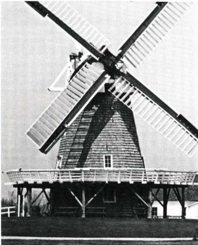
The Y supports of the wooden windmill, an accurate replica of one constructed in 1877, are repeated in the tractor shelter.

increasing in Canada. The recycling of older buildings, now perceived as a viable option for city planners, when combined with new construction, offers new and innovative design options. One example with which the reader can be left to consider is the use of the exterior of an historic building as a shell for a new facility. The Empire Arts Centre design proposes that the pressed metal facing and cast iron columns of the Cauchon Block (Empire Hotel) 1884, be used as the facade for a new structure that in conjunction with the remodelling of the Pantages Theatre will form a large performing arts complex. At present the Empire Hotel facade remains in storage following the building's demolition in 1982.