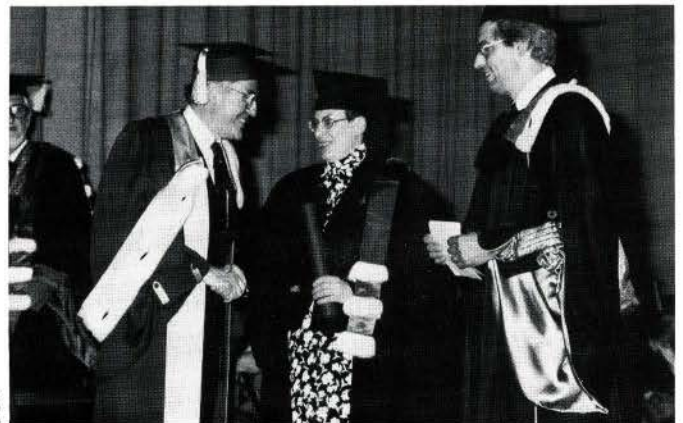
Phyllis Lambert, F.R.A.I.C., founder and director of the Canadian Centre for Architecture was awarded an honorary Ph.D. on May 29, 1985 by the Université de Montréal.

Recently appointed to the Academy of Great Montrealers, Phyllis Lambert has received several awards, most notably for 25 years of excellence from the Seagram Building in New York, for the Saidye Bronfman Centre in Montreal, for the renovation of the Biltmore Hotel in Los Angeles and for her publication: Court-House: A Photographic Document and Photography and Architecture: 1839-1939 .