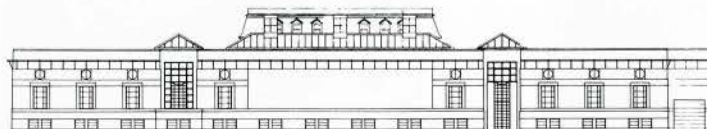
Élévation nord/North Elevation

The CCA is without question a dynamic exciting resource. The book collection alone is growing by 5,000 volumes a year. With construction of the museum scheduled to be completed in December, 1986 those interested in the study of architecture would be well advised to mark their calendars for the opening.