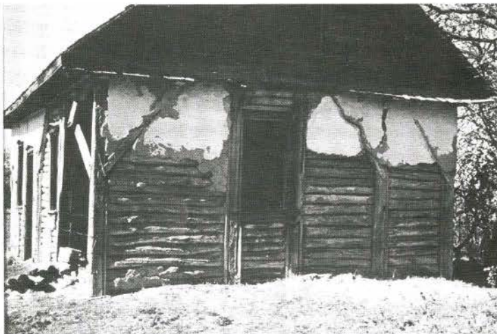
Abandoned Ukrainian farmhouse showing Red-River Frame construction and exterior mud plaster. Near Vita, Manitoba.