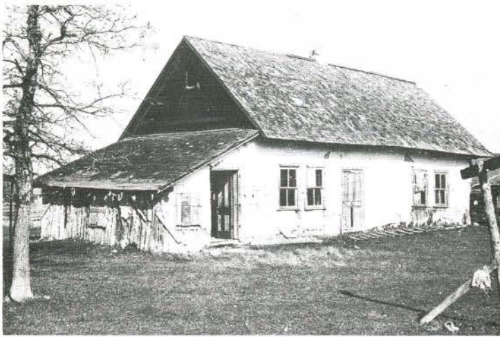
Ukrainian folk house, near Arbakka, Manitoba. Note the use of vertical tembering in the construction of both the house and the attached lean-to ( shanda ).