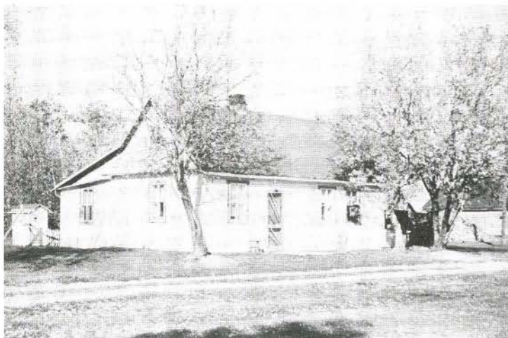
Refurbished Ukrainian pioneer house. Originally built in the 1920s this log house now has its exterior clad in modern siding. Positions of chimney, windows, and door, and the part extension on the gable end reveal its ethnic origin. Vita, Manitoba.

than the house, the base projecting about half a metre beyond the house base on either side, and had its roof ridge about a metre higher than that of the house, although it shared the same pitch as the house.