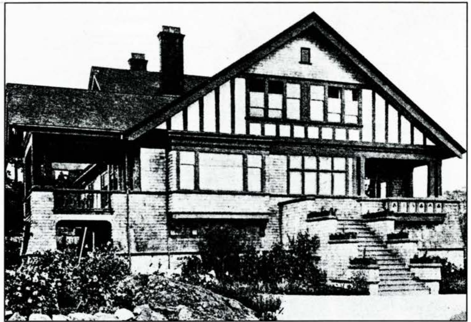
Figure 3. Alexis Martin house, 1558 Rockland Avenue, Victoria, B.C.; Samuel Maclure, architect, 1904. ( The Craftsman 13, no. 6 [March 1908])

3. The debate over regionalism in the 1940s and 1950s was yet another manifestation of a fundamental divide in architecture that has its origins at least as far back as the late 18th century, and which is still with us. For example, Mumford had written about the regional idea as early as the 1920s, and came to believe that, at root, it was not a question of form but of a reconciliation between opposing forces: that is, a reconciliation between the universal and the regional, the mechanical and the human, the cosmopolitan and the indigenous. 12