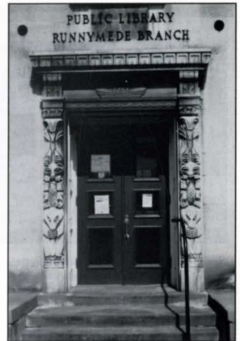
Figure 4. Runnymede Public Library, Toronto; John Lyle architect, 1929. Detail of the south entrance, with Canadianized iconography in the form of totem poles. (K. Crossman, 1995)

In the evolution of modern architecture in Canada there are two special potential pitfalls in the alley of regionalism. Internally, the boundary between regionalism and provincialism is very vague. Externally, the efforts of architects, in common with the worlds of business, politics and arts, to maintain a precious national identity as neighbours to Uncle Sam may easily lead to sun-screens of concrete maple leaves. Either one will produce only irrelevancies. 16