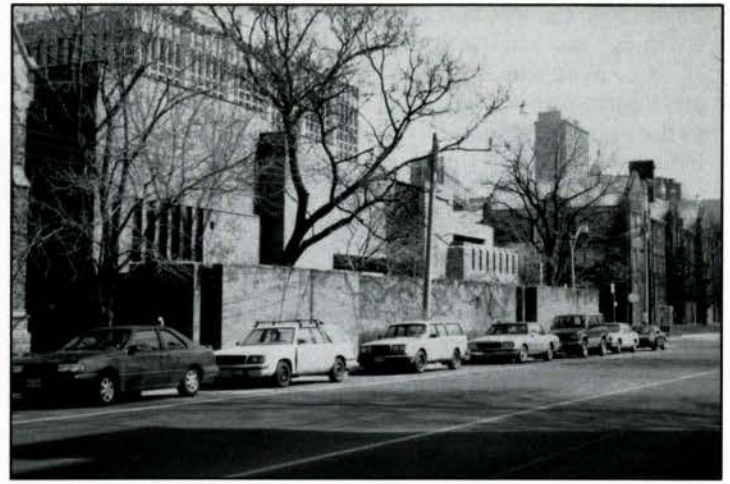
Figure 6. The Hoskin Avenue facade of Massey College, University of Toronto, as built in 1963.