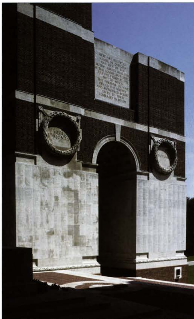
FIG. 6. MEMORIAL TO THE MISSING OF THE SOMME AT THIEPVAL, FRANCE: EDWIN LUTYENS. CLOSE-UP OF LISTS OF NAMES. | PIERRE DU PREY 1987.