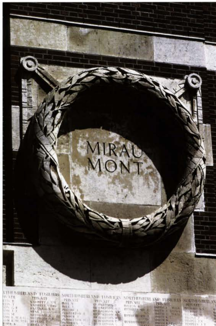
FIG. 7. MEMORIAL TO THE MISSING OF THE SOMME AT THIEPVAL, FRANCE: EDWIN LUTYENS. CLOSE-UP OF A WREATH.