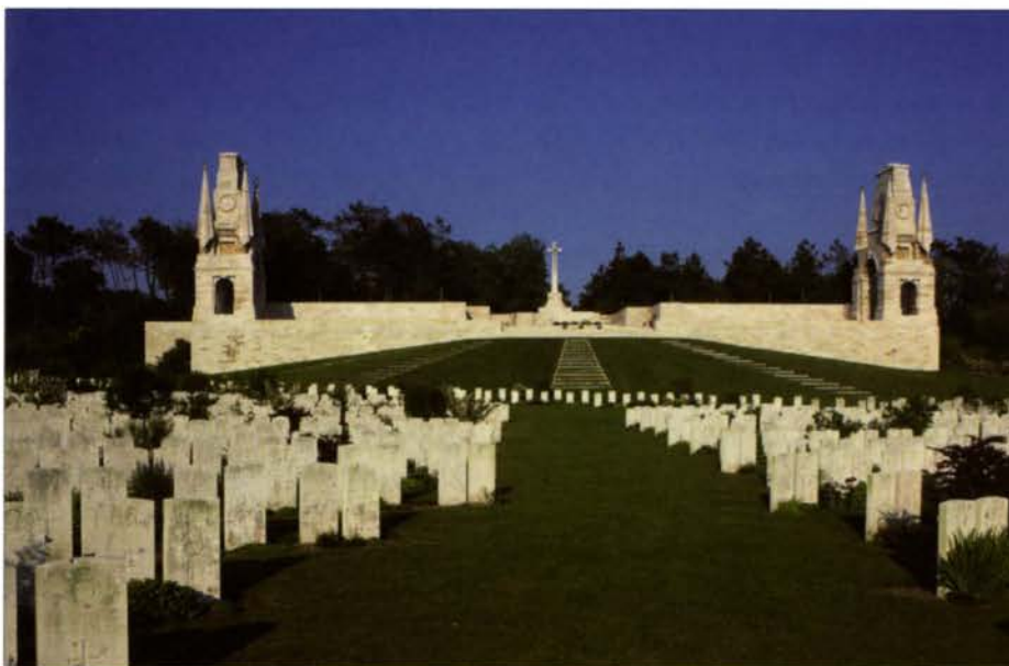
FIG. 1. ÉTAPLES MILITARY CEMETERY, FRANCE: EDWIN LUTYENS. | PIERRE DU PREY 1987.

To turn to Lutyens first, already by 1918 he had embarked on designing the war cemetery at Étaples, overlooking the English Channel from a hillside on the French coast at the site of a former