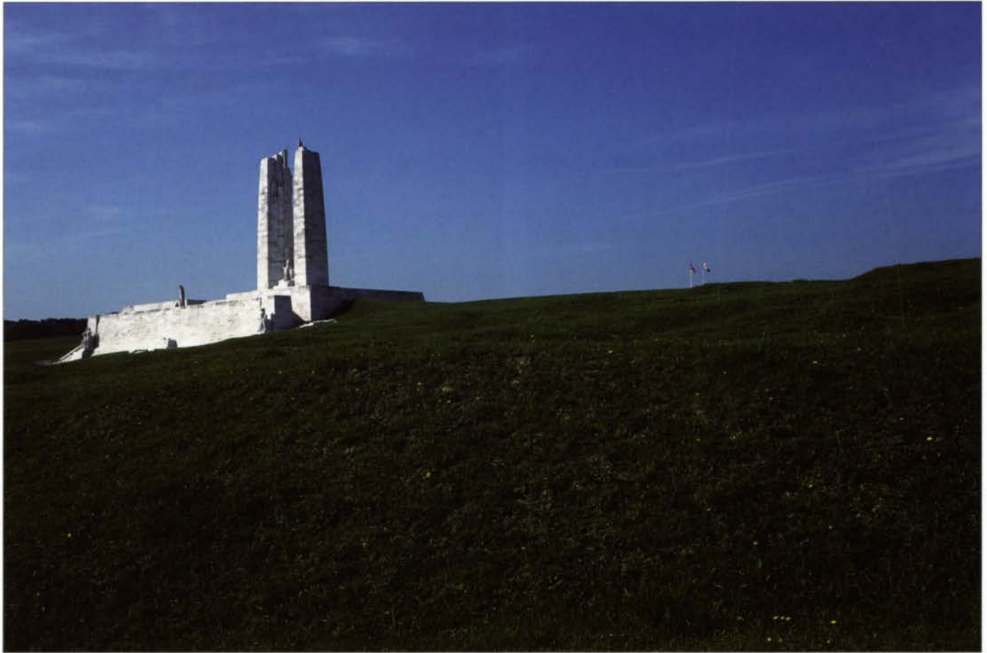
FIG. 8. CANADIAN NATIONAL MONUMENT, VIMY RIDGE, FRANCE: WALTER ALLWARD. FROM THE NORTH EAST. | PIERRE DU PREY 1987.

Looking from the north east of the ridge, to the left of the flags of Canada and of France, which officially ceded the land for the Vimy Memorial in 1922, a long wall in front of the pylons supports the embankment and a terrace. At the right end a statue group shows sympathy to the helpless and that at the left symbolizes the act of breaking the sword of war. In the centre stands what Allward's competition-winning drawing calls "An heroic figure of Canada brooding over the graves of her valiant dead" (Borstad fig. 24). Up the side walls and at the back, carvers inscribed the names of 11,285 Canadians missing-in-action in France (Smith fig. 4). Several documents,