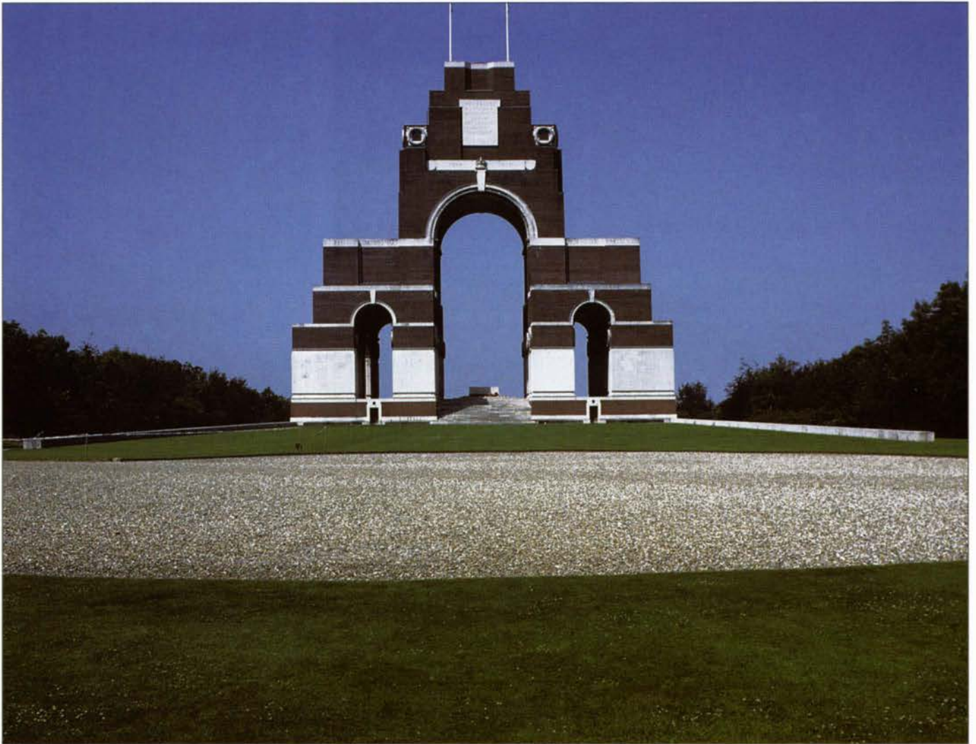
FIG. 5. MEMORIAL TO THE MISSING OF THE SOMME AT THIEPVAL, FRANCE: EDWIN LUTYENS.

In comparison to Thiepval, the Vimy Memorial enjoys a commanding location at the edge of the ridge of Hill 145. It is the most dramatically situated of the World War I grave sites on the Western Front. The architect/sculptor of Vimy, Walter Allward, never had Lutyens or Blomfield's advantage of touring the battlefields before sitting down at his drawing board. He lived in Toronto and designed the Vimy monument from his imagination, based on material provided by the Canadian Battlefields Memorial