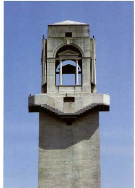
FIG. 4. AUSTRALIAN NATIONAL MEMORIAL, VILLERS-BRETONNEUX, FRANCE: EDWIN LUTYENS. CLOSE-UP OF THE TOWER. | PIERRE DU PREY 1987.

of a policy of retrenchment in the face of French Government concern over the growing number of foreign monuments on French soil. Allward responded to the same concern with regard to Vimy in a letter quoted by Jacqueline Hucker, and shortly to be quoted from more fully at the end of this postscript. The decision to consolidate resulted in the fact that the Thiepval Memorial flies the Union Jack and the tricolore ; real flags this time (fig. 5). The site slopes down to the back where a token even number of French and British unknown soldiers lie buried beneath the lawn shoulder to shoulder, as it were, in death as in battle (Coutu fig. 1). The monumental edifice, faced with French brick trimmed in Portland limestone from England, physically embodies the wartime alliance between the two countries.