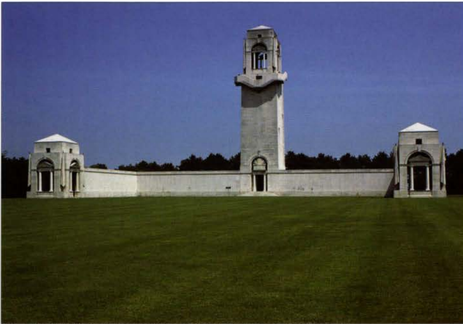
FIG. 3. AUSTRALIAN NATIONAL MEMORIAL, VILLERS-BRETONNEUX, FRANCE: EDWIN LUTYENS. | PIERRE DU PREY 1987.