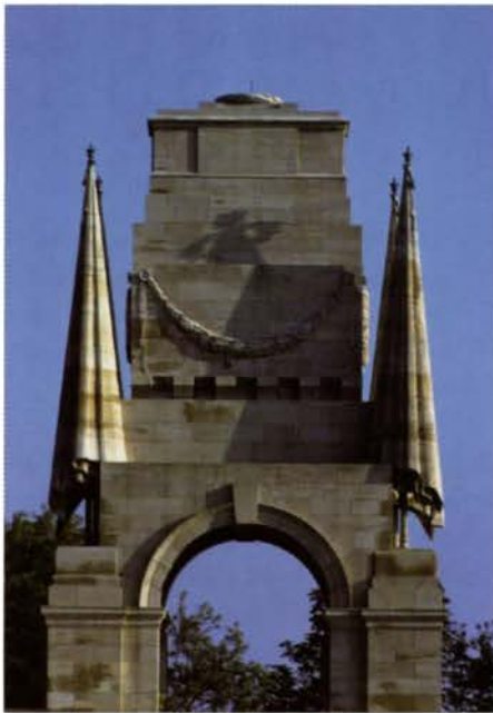
FIG. 2. ÉTAPLES MILITARY CEMETERY, FRANCE: EDWIN LUTYENS. CLOSE-UP OF ONE OF THE PYLONS.

hospital and base camp. Seen from the train line below, or from the main road among the trees up above, a carpet of around 10,000 gravestones, including 2010 Canadian ones, creates an awe-inspiring sight (fig. 1). Religious symbolism was deliberately restricted to the minimum. The centrally positioned Cross of Sacrifice, a standard feature designed by Blomfield, is flanked at either end of the platform by twin Lutyens pylons, anticipating those of Allward at Vimy. Gavin Stamp's article earlier in this issue calls these pylons "cenotaphs", thus drawing attention to their similarity to Lutyens's Cenotaph on Whitehall in London (cf. Stamp figs. 2, 13).