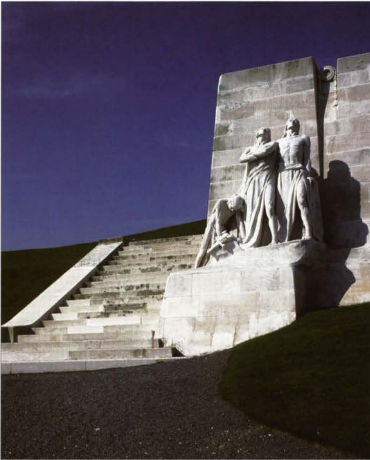
FIG. 9. CANADIAN NATIONAL MONUMENT, VIMY RIDGE, FRANCE: WALTER ALLWARD. CLOSE-UP OF THE SOUTH END.