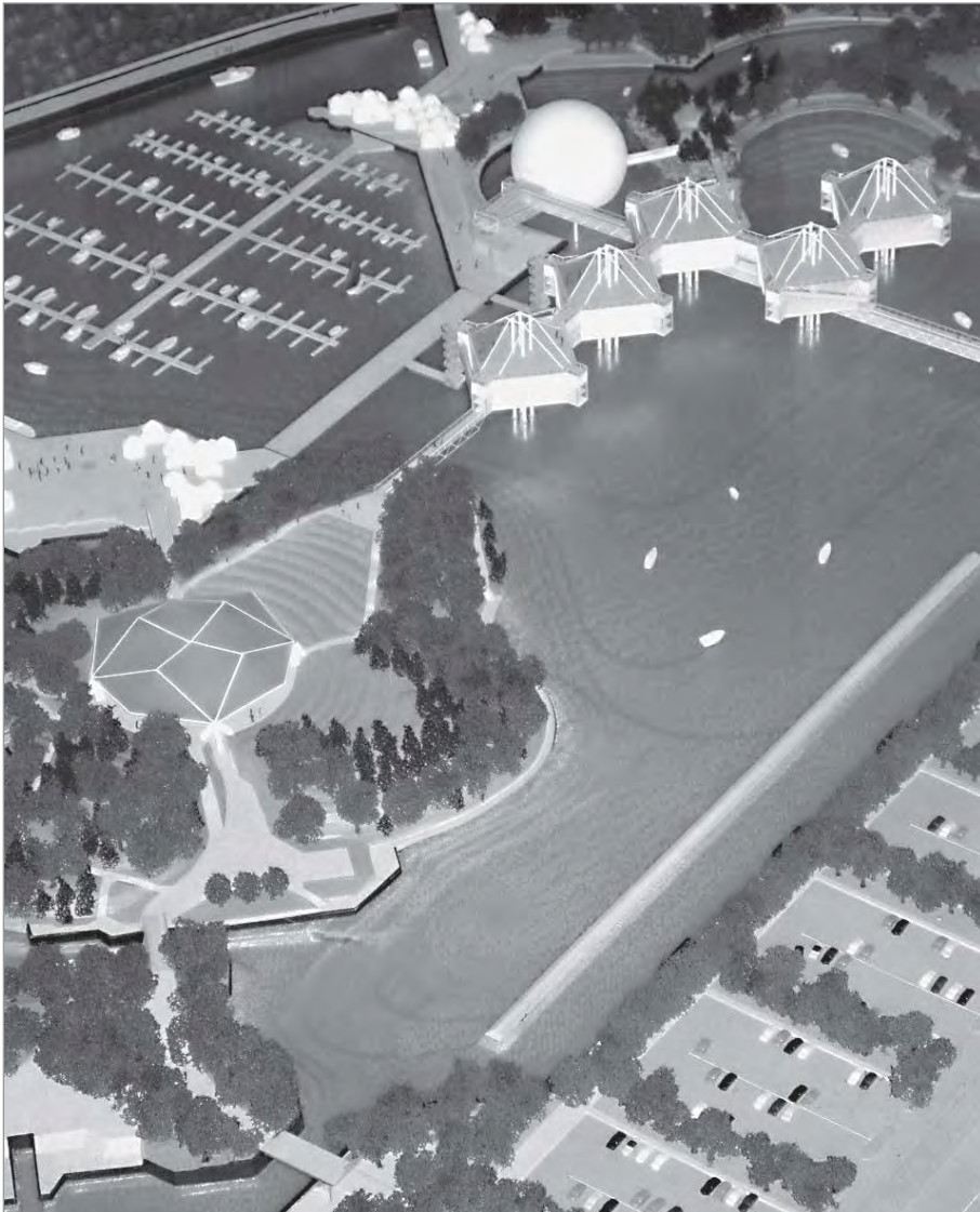
FIG. 9. ONTARIO PLACE (CRAIG ZEIDLER AND STRONG, 1968-1971), LIKE OTHER EXAMPLES OF MEGASTRUCTURE THAT EXPRESSED THE VALUES OF THE 1960S AND 1970S IN WAYS THAT GARNERED INTERNATIONAL ACCLAIM, HAS FACED AN UNCERTAIN FUTURE LESS THAN TWO GENERATIONS AFTER ITS OPENING.