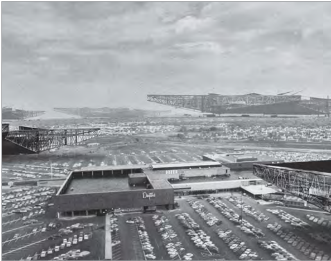
FIG. 6. RECENT THEORETICAL SPECULATION, SUCH AS "BATTLE OF THE MEGASTRUCTURES 1956," WHICH COMBINES VICTOR GRUEN'S SOUTHDALE CENTER AND CONSTANT'S NEW BABYLON, IS EVIDENCE OF THE RENEWED INTEREST IN MEGASTRUCTURE WITHIN INTERNATIONAL CONTEMPORARY ARCHITECTURAL DISCOURSE. | WAI ARCHITECTURE THINKTANK.