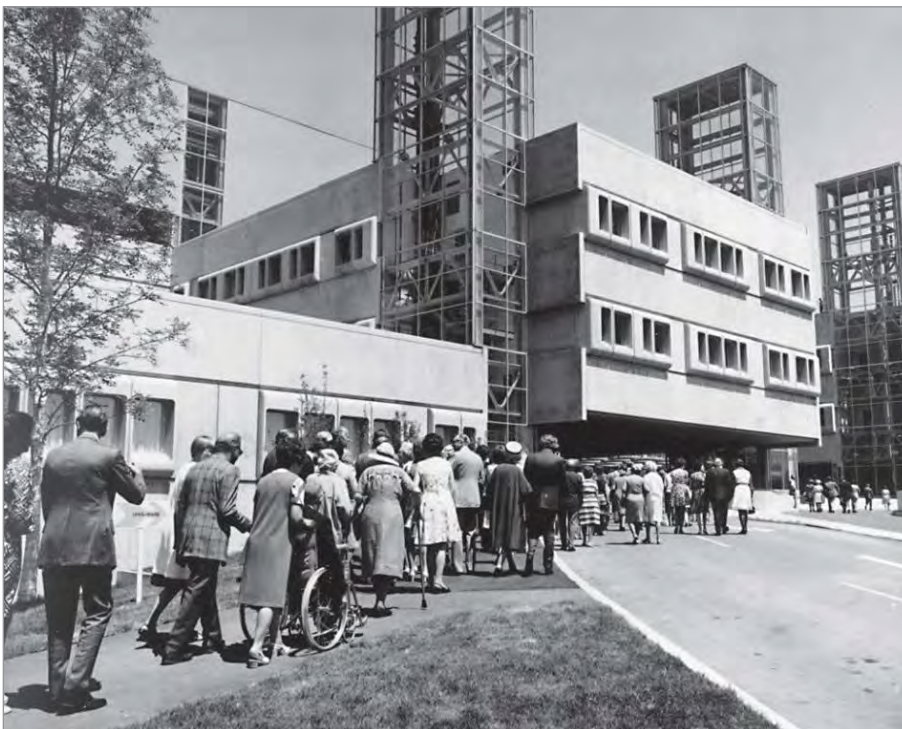
FIG. 1. EXPRESSING VALUES REFLECTED IN THE ROYAL COMMISSION ON HEALTH SERVICES OF 1964, MCMASTER HEALTH SCIENCES CENTRE (CRAIG, ZEIDLER AND STRONG, 1968-1972) SIGNALLED A SHIFT TOWARD SUPPORTING RESEARCH, TEACHING AND PATIENT CARE IN AN INTERDISCIPLINARY, INTEGRATED MANNER.

While the megastructure movement of the 1960s and 1970s was international in scope, Canada was particularly fertile ground for the megastructure. In an environment of dynamic economic expansion, urbanization, as well as cultural and social transformation, there was an expression of national and regional identities. The legacy includes internationally celebrated projects such as Toronto's Scarborough College, Hamilton's McMaster Health Sciences Centre, and Montreal's Habitat '67. Perhaps no other building type, if one can indeed call megastructure a type, is more closely associated with large-scale institutional architecture of the 1960s