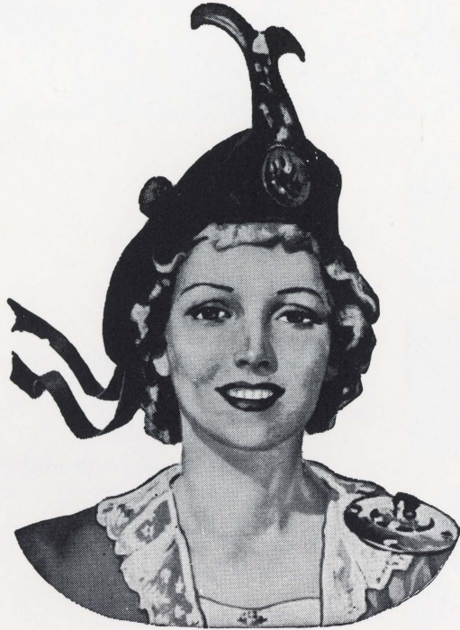
THE MACDONALD LASSIE