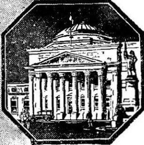
Head Office Montreal

B ehind every branch —the full resources, or- ganization and experience of the entire institution.