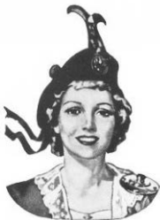
THE MACDONALD LASSIE