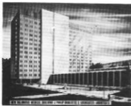
—The Sir Charles Tupper Medical Building, a Canada Centennial Project.