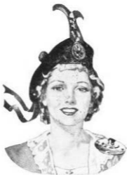
THE MACDONALD LASSIE