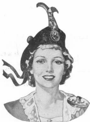
THE MACDONALD LASSIE