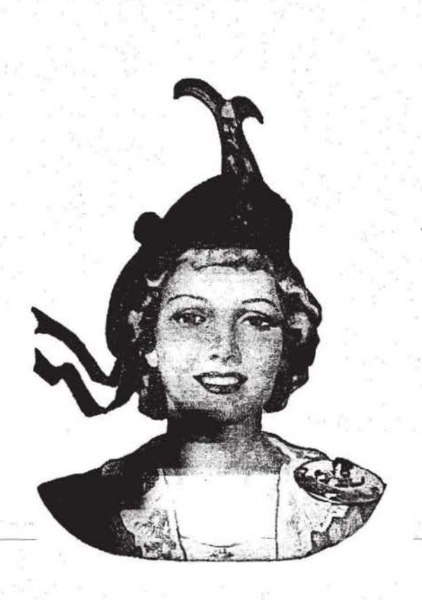
THE MACDONALD LASSIE