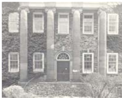
The Old Law Building, n.d.