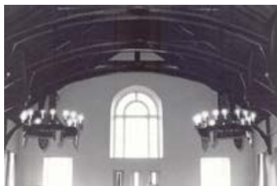
Beamed Ceiling - The Great Hall - Faculty Club. May 1978