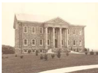
University Club (old Arts building and Law School), c1928-1976