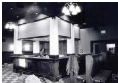
Construction of Faculty Club Pub - Bar Area, January 10, 1980