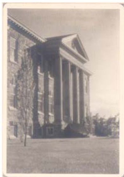
University Club (old Arts building and Law School) - Sepia-toned Photo, c1928-1976