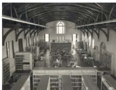
University Club (Law Library classroom), n.d.