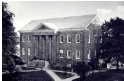
The Faculty Club, n.d.

Ivy from the old Dalhousie Law School, February 1966