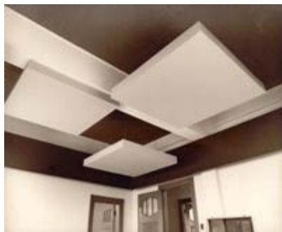
Dalhousie Faculty Club - Under Construction Interior - Square Ceiling Fixtures, February 15, 1972