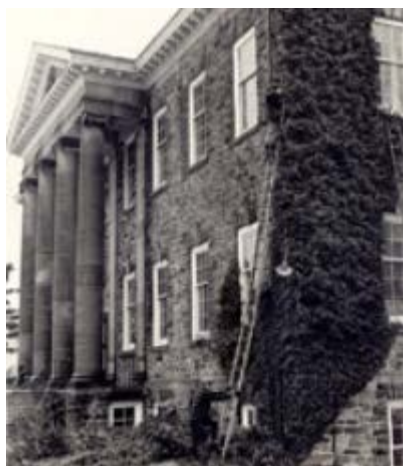
Workmen remove the two-foot thick