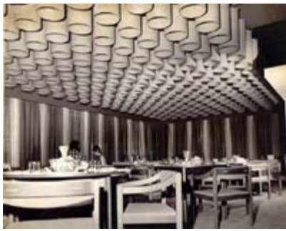
Faculty Club - The Dining Room, November 9, 1972