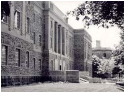
Sir James Dunn Science Building - Main Entrance nears completion [1], n.d.