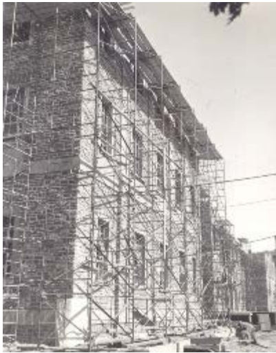
Sir James Dunn Science Building - View of the main entrance under construction, 1960