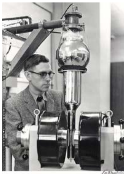
Sir James Dunn Building Physics (Laboratory), 1962