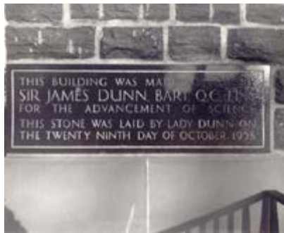
Sir James Dunn Building - Cornerstone, n.d.