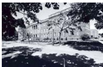
Sir James Dunn Science Building - Exterior, November 1980

Contractor: Foundation Maritimes Limited