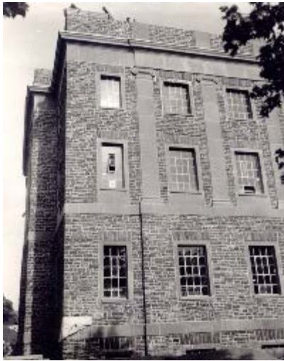
Sir James Dunn Science Building nears completion as seen from the University of King's College, n.d.