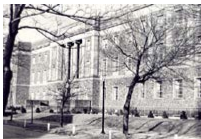
Sir James Dunn Building - Exterior - Front Entrance - 2, n.d.