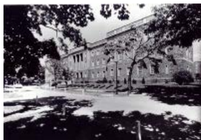
Dunn Building [Exterior], 1980

Contractor: Foundation Maritimes Limited