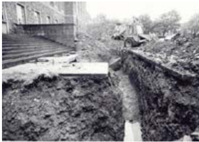
Sir James Dunn Building - Perimeter Drainage System Repair - 1, September 25, 1975