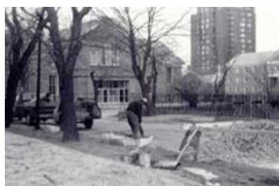
Repairing the drainage lines in the Dunn parking lot, April 1984