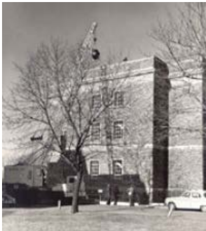
Sir James Dunn Science Building - South Wing, Loading Zone, n.d.