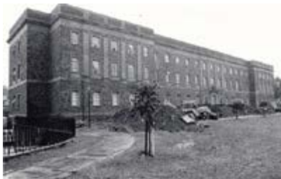
Sir James Dunn Building - Perimeter Drainage System Repair - 2, September 25, 1975