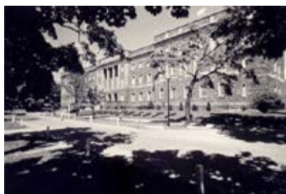
Sir James Dunn Building - Exterior - Front Entrance - 1, n.d.