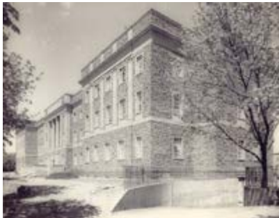
View of the Sir James Dunn Science Building on the South Side, n.d.