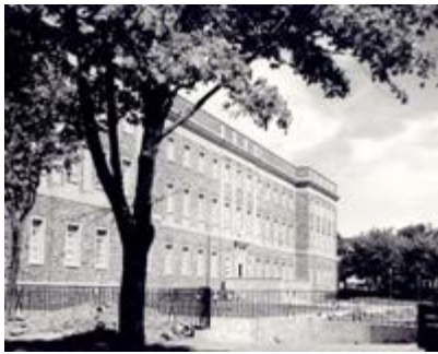
Sir James Dunn Science Building - Main Entrance nears completion [2], June 13, 1960