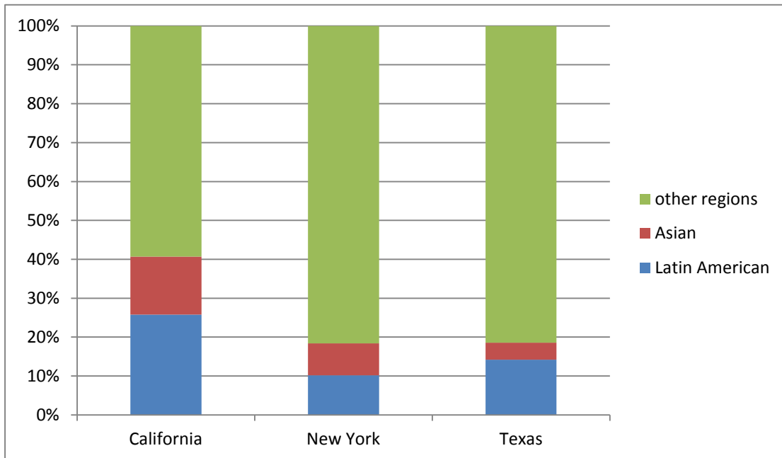
Figure 2: Percent Immigrants by State: 2010. Adapted from “The foreign born from Asia: 2011”. (ACSBP Publication No. 11-06). Retrieved from www.census.gov/prod/2012pubs/acsbr11-06.pdf ; The foreign-born population from Latin America and the Caribbean: 2010. (ACSBP Publication No. 10-15). Retrieved from www.census.gov/prod/2011pubs/acsbr10-15.pdf

The descriptive statistics conditional upon English-language proficiency are shown in Table 1 with the columns presenting the two levels: “Proficient” and “Non-Proficient”, respectively. Recall that “Proficient” is defined as the self-reported ability to speak English as “very well”, whereas “Non-Proficient” corresponds to the categories including “well”, “not well” and “not at all”.