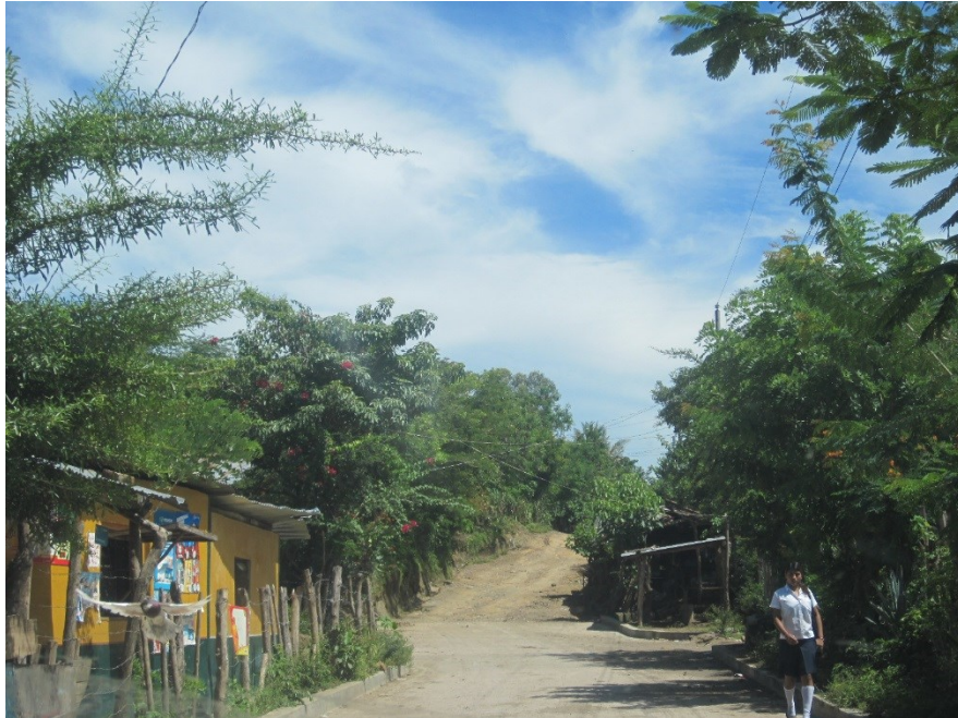
Figure 4. A community road in Usulután, El Salvador.

When asked to describe their lives before getting involved with the work of CBM and IBE, many participants described similar situations. The effects of the Civil War have been long-lasting, especially in rural communities in eastern El Salvador where a lot of the fighting took place. Multiple individuals described their homes and communities as defined by poverty – inadequate shelter, no access to clean water, and limited employment opportunities.