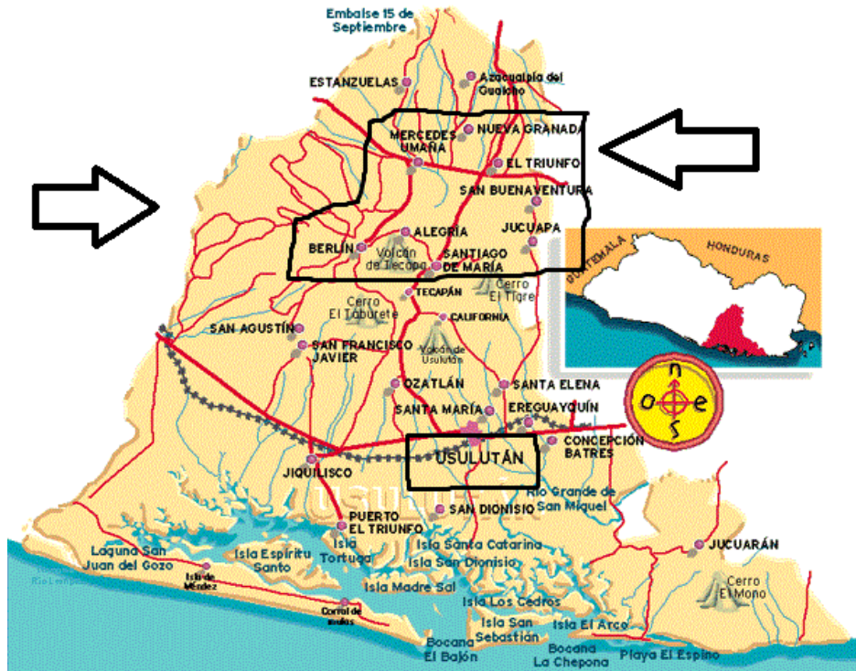
Figure 5. Map of Usulután region, El Salvador.

The focus changed and they began working towards their goals, person by person, community by community. Following are examples of the successful work that has been accomplished through the partnership of CBM and IBE in Usulután.