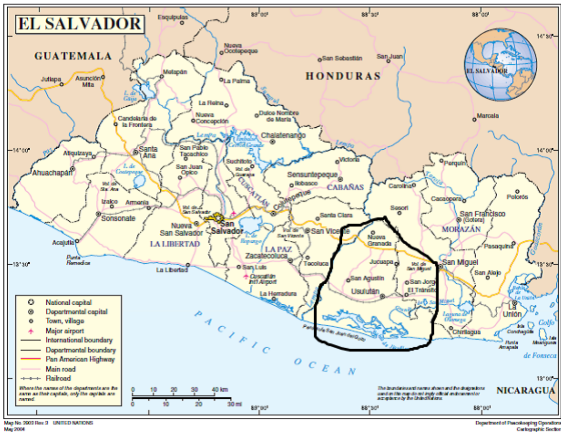
Figure 3. Map of El Salvador. (UN, 2013)