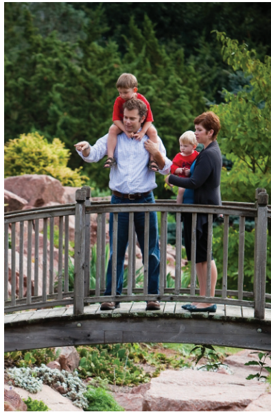
Alumni and family enjoying the rock garden