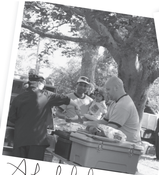
A family barbecue on a warm summer night.