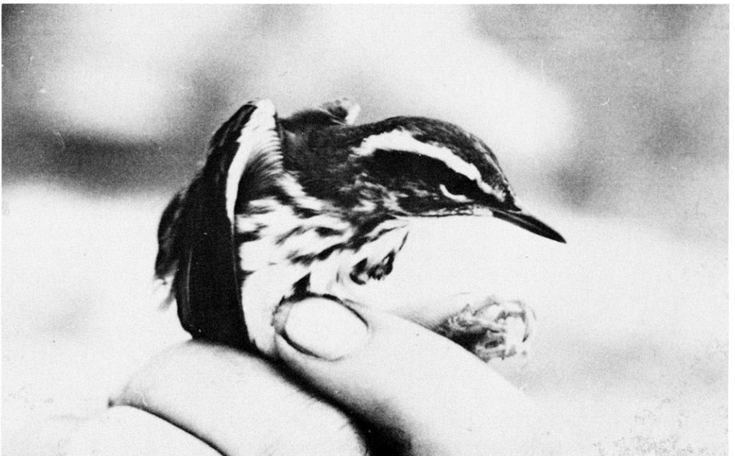
Fig 15 A representative vagrant warbler from the eastern United States, a Louisiana Waterthrush, was captured in an outbuilding for a first authenticated provincial record. (Photo: 9 August 1970, J. Burton.)