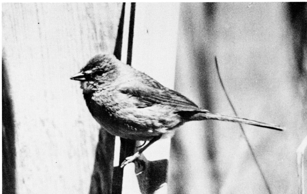
Fig 16 The province's third (and the island's only) Green-tailed Towhee, a vagrant from the southwestern United States, was found at the Meteorological Station. (Photo: 10 June 1974, D.W. Finch.)