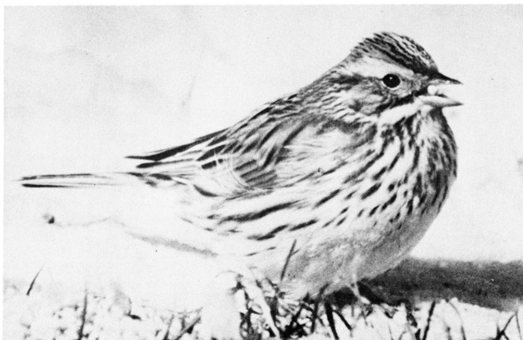
Fig 17 The island's most famous avian inhabitant is the Ipswich Sparrow, a large, pale race of the Savannah Sparrow. (Photo: early April 1971, I. McLaren.)